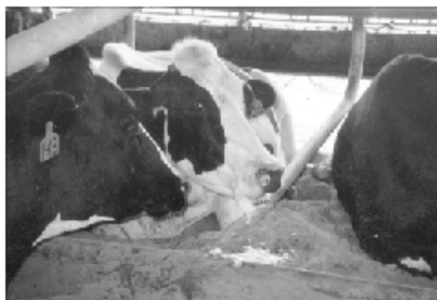
Heat stress is a seasonal factor that decreases dry matter intake and can affect milk production and composition.